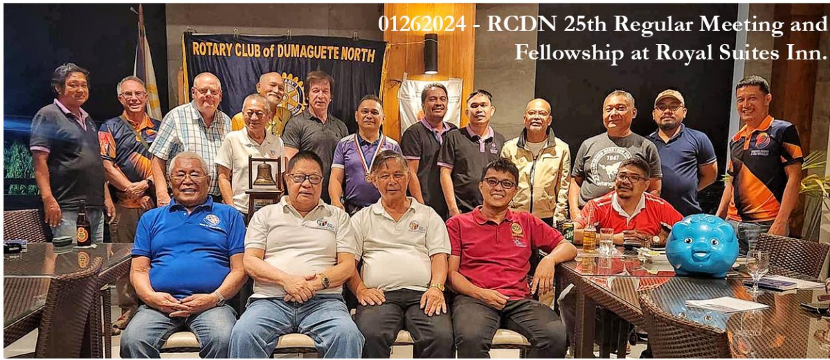
01262024 - RCDN 25th Regular Meeting and Fellowship at Royal Suites Inn.