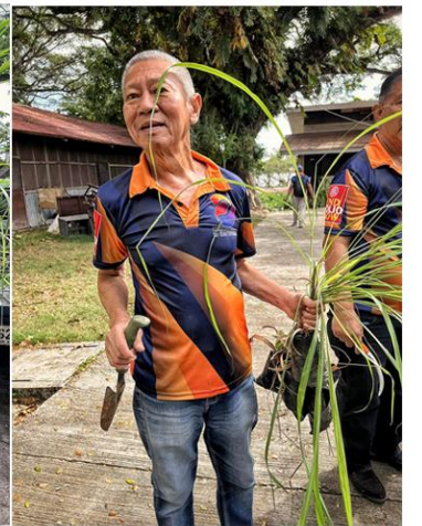
01272024 - Citronella Awareness Campaign and Planting at Silliman University Junior High School.